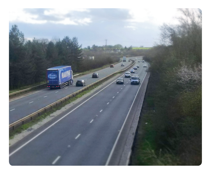
Rail Central will connect directly to the A43

The Phase Two consultation will take place once we have the comprehensive results of all technical assessments, including the highways model. We will then be in a position to share updated plans as well as a body of supporting information in the form of a draft Environmental Statement (ES).