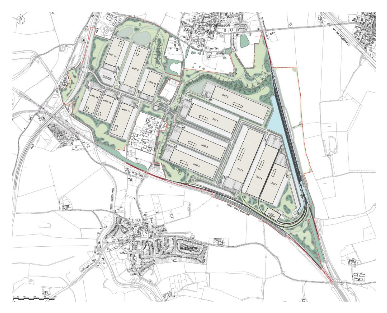
Figure 3 Illustrative Colour Masterplan

6.5 The feedback received from the first phase of consultation was reviewed in detail by the project team. This has informed the further work now progressed and design of the masterplan option now being consulted on as part of the Phase 2 Consultation. An extract of the latest Illustrative masterplan is shown at Figure 3 below.