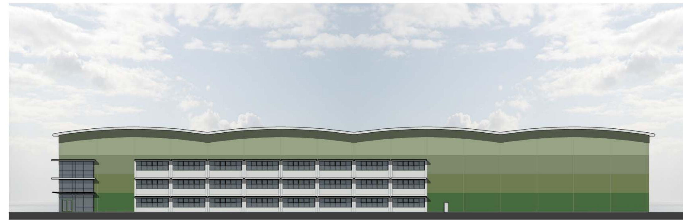
03 115 SOUTH ELEVATION 1:500